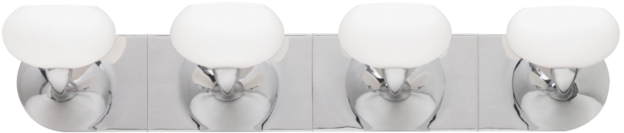
FROST Shown approximately 20% actual size.