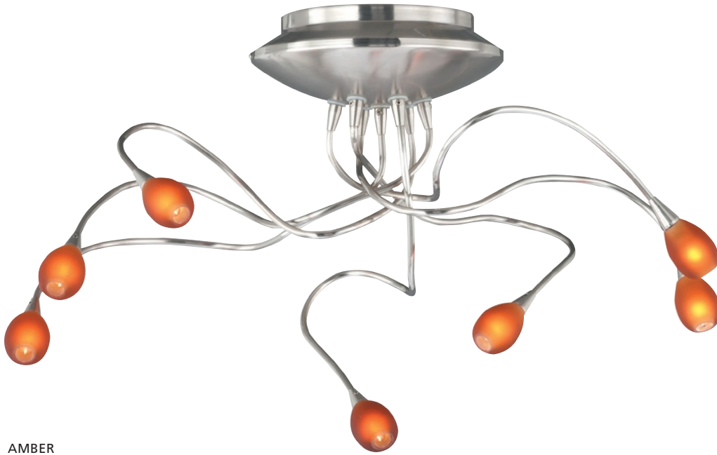
AMBER Shown approximately 30% actual size.