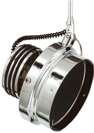
BIG ELVIS Shown approximately 30% actual size.