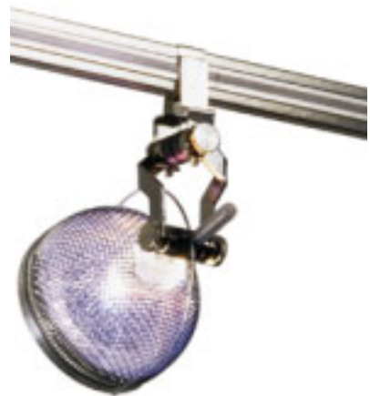
M0-Pivot with Mesh Backlight Shield and Louver Lens Holder Accessory