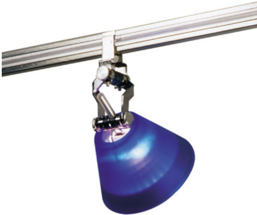
M0-Pivot with Cone Glass Shield Accessory Shown approx. 65% actual size