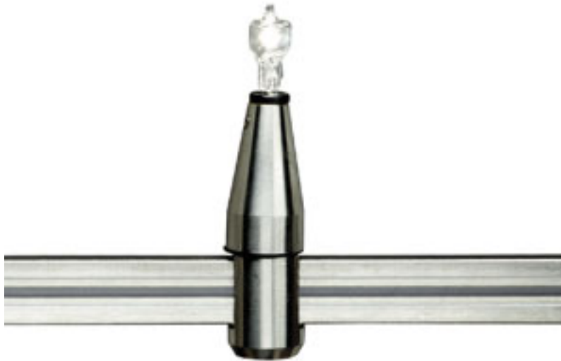
M0-Sparky Shown approx. actual size