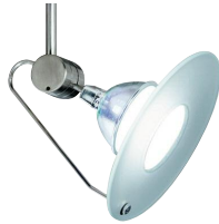
SPROCKET WITH SPY ACCESSORY