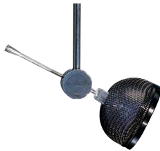
SPROCKET WITH MESH BACKLIGHT SHIELD ACCESSORY

Socket terminates with FreeJack male connector, which may be installed into a system connector. Elements ordered with a system prefix include a connector for that system.