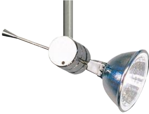
SPROCKET Shown approximately 55% actual size.