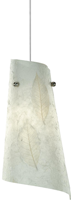
AUTUMN WIND Shown approximately 20% actual size.