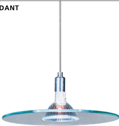
BIZ Shown approximately 40% actual size.