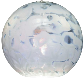
MOONSTRUCK Shown approximately 60% actual size.