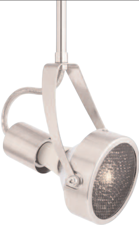
SPORTSTER, PAR30 WITH SPORTSTER LOUVER LENS HOLDER AND EGGCRATE LOUVER Shown approximately 50% actual size.