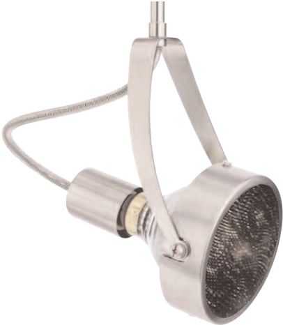
SPORTSTER PAR38 WITH SPORTSTER LOUVER LENS HOLDER AND EGGCRATE LOUVER