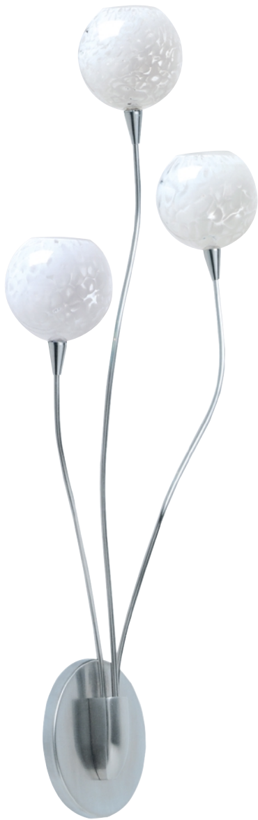
MOONSTRUCK Shown approximately 25% actual size.