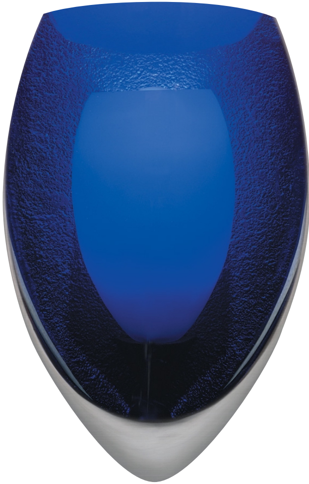
COBALT Shown approximately 55% actual size.